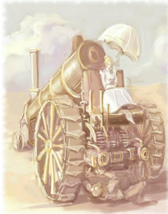
Figure 2 – Fixing The “Infernal Device”