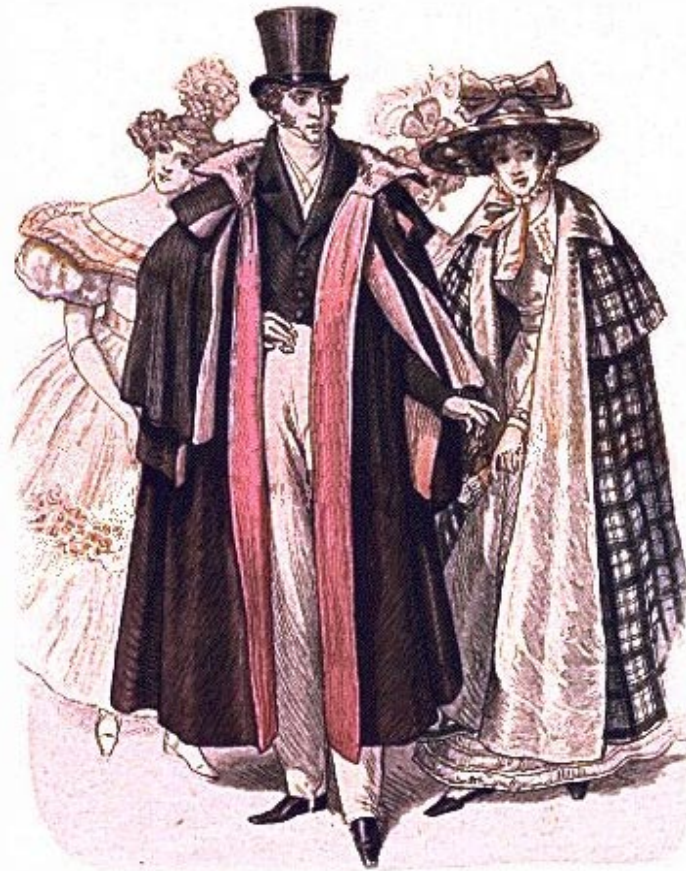
Figure 1 – English Nobleman And Companions